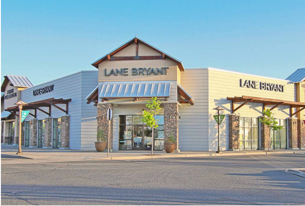
At the Main Entrance to the Shopping Center