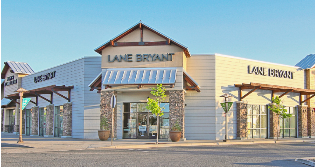
At the Main Entrance to the Shopping Center