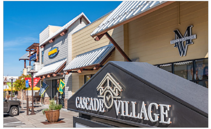
Center Co-Tenants Include

The Village Plaza is Cascade Village's social gathering place for families and friends, featuring a custom water/fire display, and hosts numerous events throughout the year beneath the center's iconic stone clock tower.