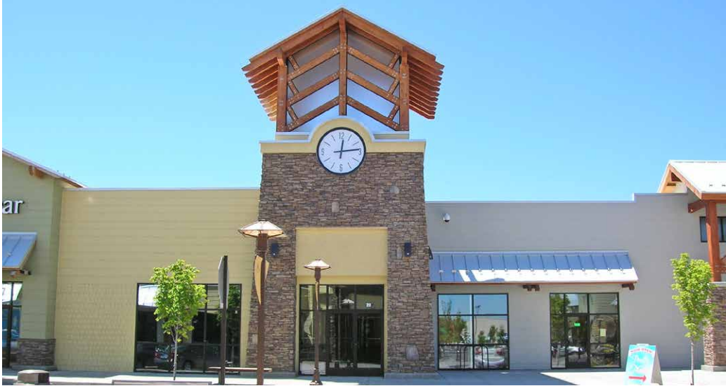
Prominent Storefront Under Clock Tower