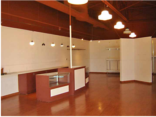
2,614 SF | $20/SF/Yr. NNN

NB NEVILLE & BUTLER Commercial Real Estate